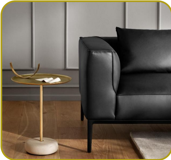
Orai- ORI300- 3 Seater Soft, Leather

In accordance with EN 15804+A2 and ISO 14040 / ISO 14044