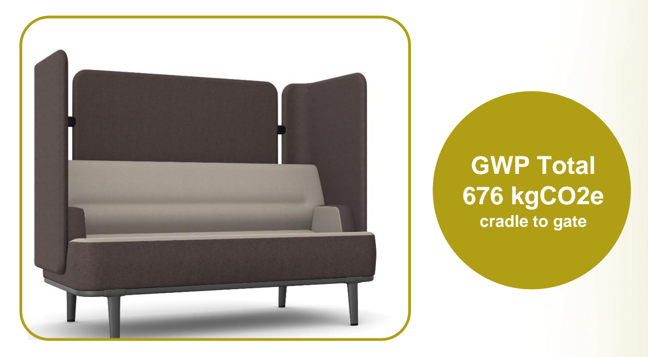
Mote 2 Seater Sofa With Screens- MTE-BSF02