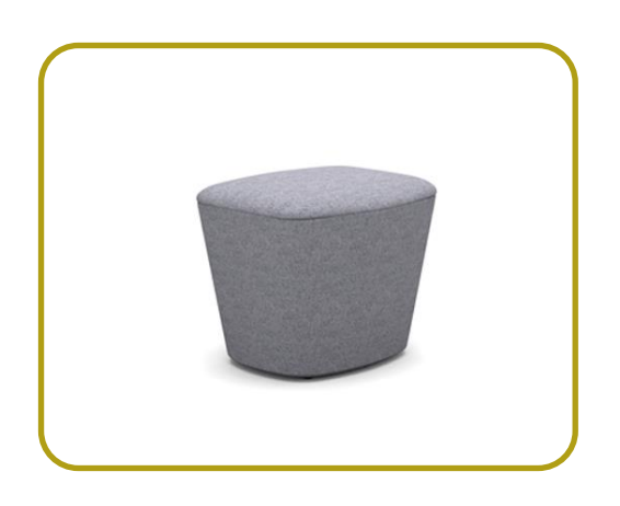
Famiglia Footstool- FMGFS

In accordance with EN 15804+A2 and ISO 14040 / ISO 14044